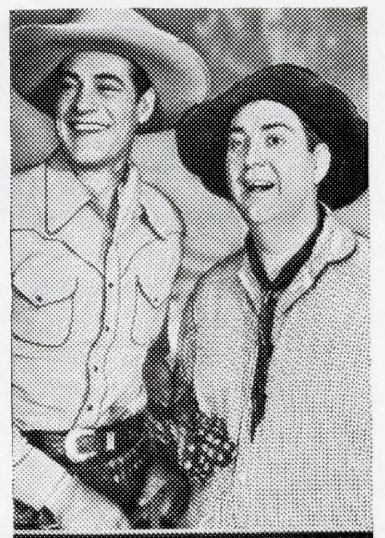
Starrett-Burnette Mat 1-A

The West's newest and most popular screen team—Charles Starrett and Smiley Burnette, now starring in Columbia Pictures' exciting action film, "Galloping Thunder," at the ..... Theatre.